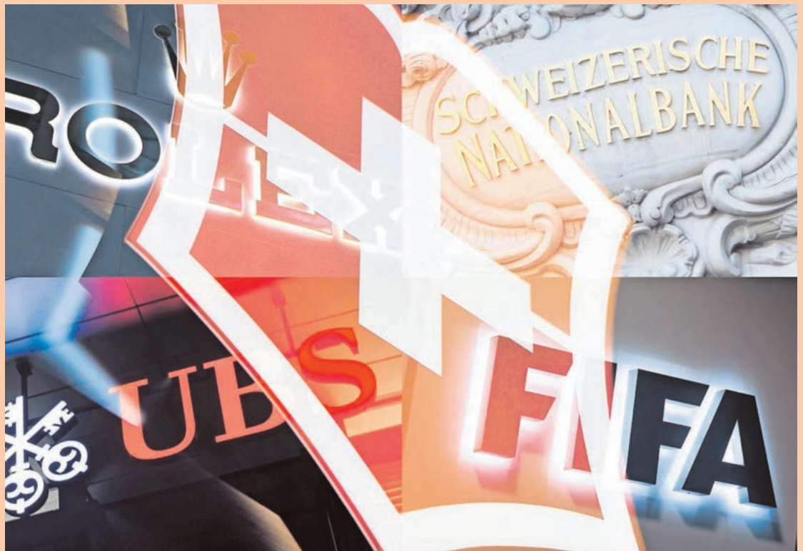
Global clout, clockwise from left – Rolex, the Swiss National Bank, Fifa and UBS: enterprises and institutions based in the country are having to adjust to changing circumstances

His Texas experiment is an example of how Swiss businesses and entrepreneurs are seeking to reinvent themselves after a series of crises and scandals that have threatened the country's reputation. Switzerland's 8m citizens are the wealthiest in the